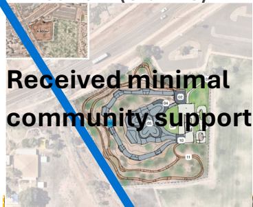
Bulgarra Sporting Precinct 1 (Old KEC)